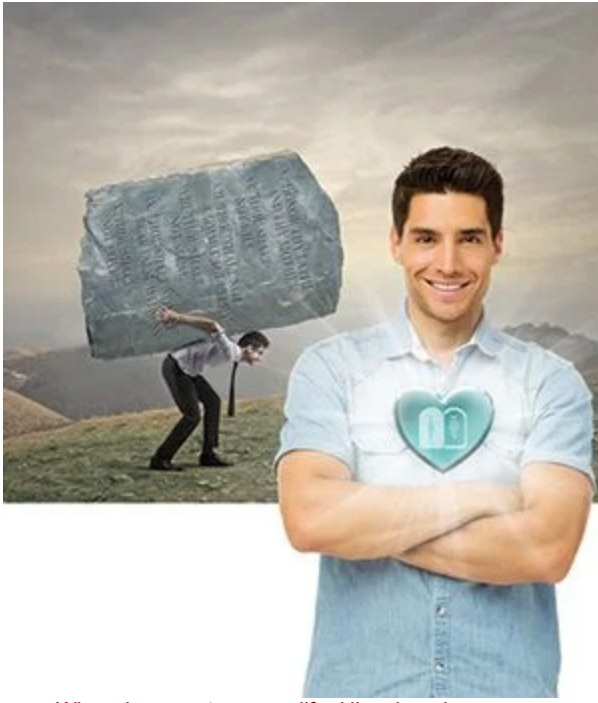
When Jesus enters your life, His miraculous power transforms obedience from a burden to a joy.

Person's life within you. Obedience is the natural response of love in your life. Being born of God, as a new creature, you want to obey Him because His life has become a part of your life. To please someone you love is not a burden, but a delight. "I delight to do thy will, O my God: yea, thy law is within my heart." Psalms 40:8.