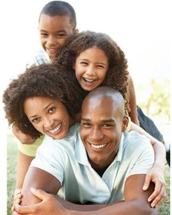
No joy on earth can compare to the happiness and joy of a Christian home.

Answer: Many feel that the Christian life will not be a happy one because of self-denial. The exact opposite is true! When you accept the love of Jesus, joy springs up within you. Even when hard times come, the Christian can enjoy God's assuring and powerful presence to overcome and "to help in time of need" (Hebrews 4:16).