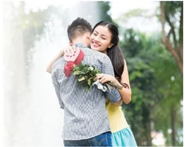
It is not a burden to please someone you truly love.

Person's life within you. Obedience is the natural response of love in your life. Being born of God, as a new creature, you want to obey Him because His life has become a part of your life. To please someone you love is not a burden, but a delight. "I delight to do thy will, O my God: yea, thy law is within my heart." Psalms 40:8.