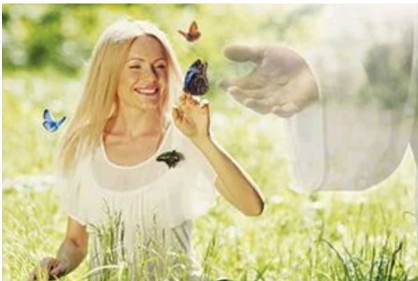
Jesus' power changes a repulsive sinner into a loving saint.

for salvation will receive it. The worst sinner is accepted just as completely as the one who sins the least. Your past does not count against you! Remember, God loves everyone alike and forgiveness is simply for the asking. “By grace you have been saved through faith, and that not of yourselves; it is the gift of God, not of works, lest anyone should boast” (Ephesians 2:8, 9).