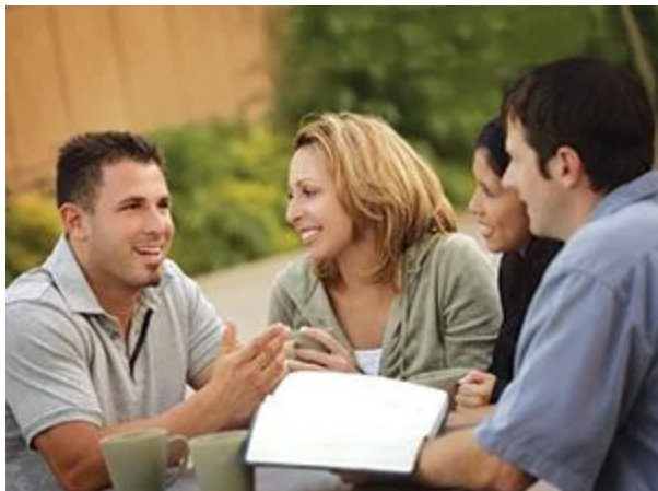
Your love for Jesus will also deepen as you share His love with others.

Answer: No personal relationship can prosper without communication. Prayer and Bible study are forms of communication with God, and they are essential in keeping your relationship with Him growing. His Word is a “love letter” that you will desire to read daily to nourish your spiritual life. Conversing with Him in prayer will deepen your devotion and open your mind to a more thrilling and intimate knowledge of who He is and what He seeks in your life. You’ll discover amazing details of His incredible provision for your happiness. But remember, as in other personal relationships, the loss of love can turn a paradise into slavery. When we cease to love Christ and His example, religion will exist only as forced compliance to a set of