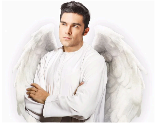
Lucifer was a heavenly angel created by God. He was perfect in wisdom and beauty and stood next to God's throne.