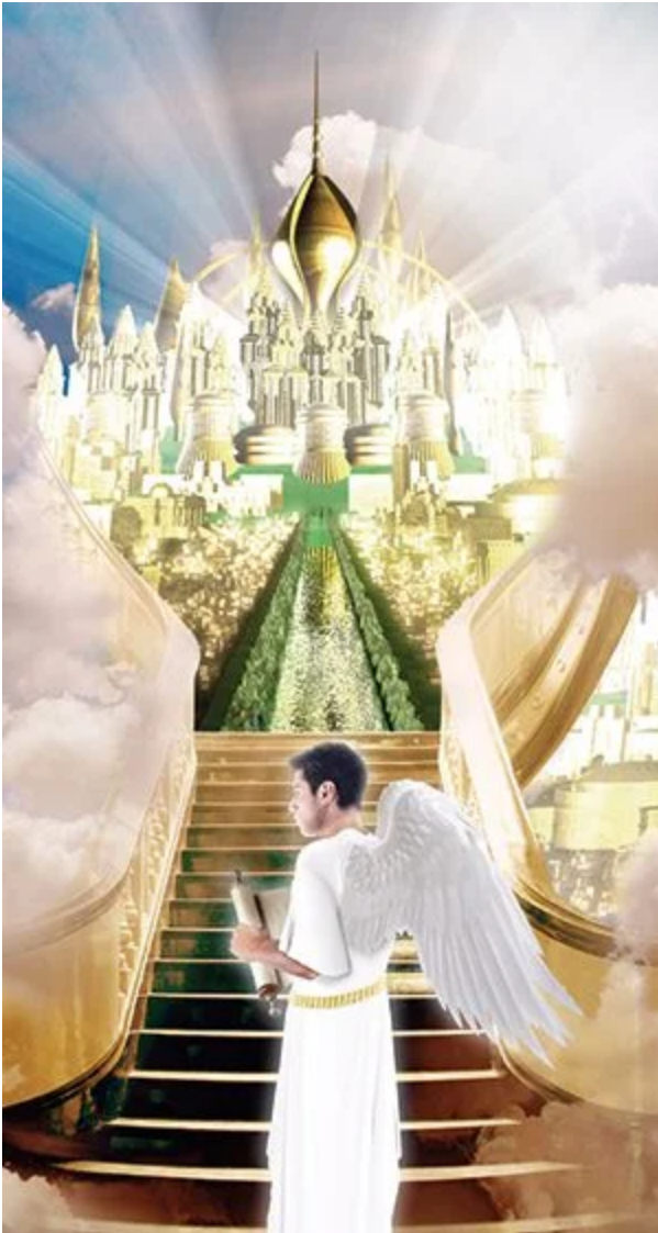
Satan was living in heaven when he sinned. His name was Lucifer, which means "Day Star."