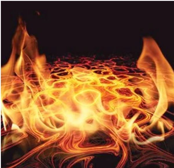
At the end of the world, Satan will be thrown into the lake of fire, which will turn him into ashes and end his existence.

“I brought fire from your midst; it devoured you, and I turned you to ashes upon the earth in the sight of all who saw you. ... You ... shall be no more forever” (Ezekiel 28:18, 19).