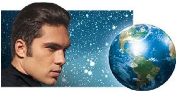
Satan's headquarters is the earth. He hates human beings and aims to hurt God by destroying you.

Answer: Lucifer deceived a third of the angels (Revelation 12:3, 4) and caused a rebellion in heaven. God had no choice but to cast out Lucifer and the other fallen angels, because Lucifer's aim was to usurp God's throne even if it meant murder (John 8:44). After his expulsion from heaven, Lucifer was called Satan, meaning “adversary,” and the devil, meaning “slanderer.” The angels who followed Satan were called demons.