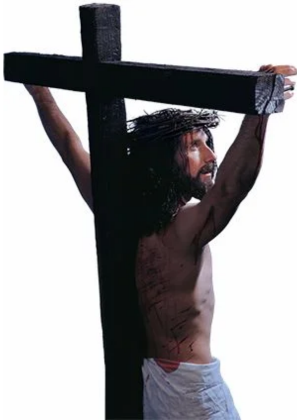
Jesus made the destruction of sin possible.

Second , sin will be purged from the universe by the permanent destruction of all those who choose it: the devil, the demons, and people who have followed them. God's Word is clear on this point; sin will never again arise to harm His creation or His people.