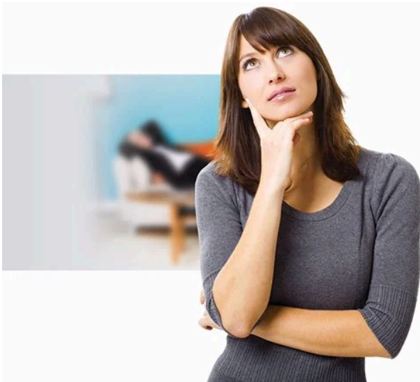
The wrong kind of thinking can destroy your marriage.