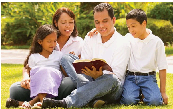
With Christ in your hearts and home, marriage will be successful.